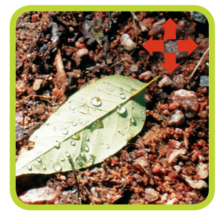
Transformations (when things change into other things). Dead leaves decompose into smaller organic materials. Rock weathers into soft clay. Oxygen reacts with iron, "rusting" the soil to a reddish color.