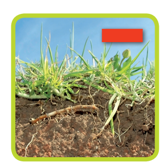
Losses. Water in soil evaporates.Nutrients are taken up by plants. Soil particles wash away in a storm. Organic matter may decompose into carbon dioxide.