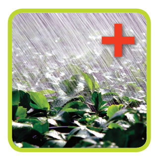
Additions. Rain adds water. Dust adds minerals. Animal wastes add organic matter and nutrients. Humans add fertilizers.