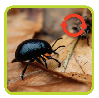
Translocations (when things move within the soil). Gravity pulls water (carrying minerals and nutrients) down from top to bottom. Evaporating water draws minerals up from the bottom to top. Organisms carry material every which way.