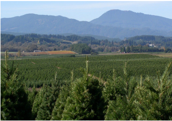
Fig. 5. Christmas tree plantations on Jory soil.