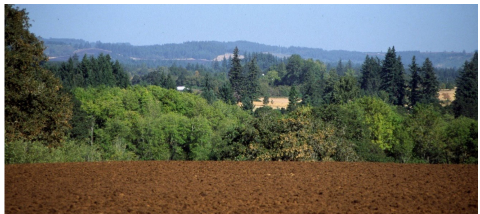
Fig. 1. Landscape of Jory soil in the foothills surrounding the Willamette Valley.

Jory soil series are very deep, well drained soils developed from materials that have been transported from higher slopes ( colluvium ) and weathered from basic igneous (basalt) bedrock ( residuum ). The weathered material from the bedrock becomes the Jory soil. They are found on the nearly level to very steep slopes of the foothills of the Willamette Valley ( Figure 1 ). These slopes range from 2 to 90 percent but are dominantly 5 to 50 percent. When occurring on slopes of less than about 12 percent, the soils are designated as prime farmland soils by the United States Department of Agriculture - Natural Resources Conservation Service (USDA-NRCS). Every soil can be separated into three separate size fractions called sand , silt and clay . They are present in all soils in different proportions and say a lot about the character of the soil. In Jory soil, the topsoil or A horizon (the layer of soil that we plow or plant seeds in) is silty clay loam in its feel, has a dark reddish-brown color, contains a high amount of organic matter, and can be up to