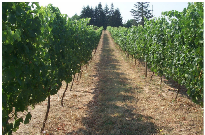
Fig. 7. Permanent grass cover between rows of wine grape vines on Jory soil to protect the soil surface from erosion.