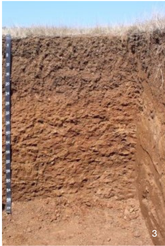
Fig. 2. Soil Profile of a Jory soil formed in colluvium and residuum from basalt bedrock.