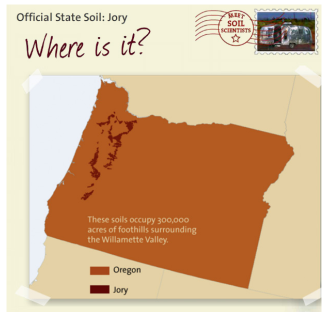
Fig. 4. Location of the Jory soil in Oregon.

Jory series covers about 300,000 acres of land in nine counties of Oregon. It is one of the most extensive soils in the portions of Oregon referred to as the Willamette Valley Foothills and Umpqua Interior Foothills. In all, there are a total of approximately 2,000 named soils (series) in Oregon (see web links for more information).