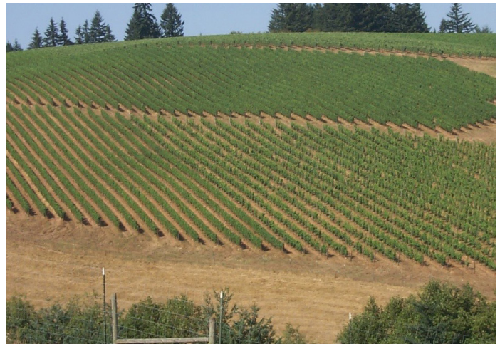
Fig. 6. Vineyard on Jory Soil.

When a soil cannot be used for one or more of the described functions, it is referred to as a limitation. Soil experts, called Soil Scientists , studied Jory soil and identified that it has few limitations except for the high clay content, its hazard of erosion when it occurs on steep slopes, and moderate or strong acidity. The high clay content limits its ability to transport water down through the profile. This can create limitations in using the Jory soil for waste water disposal and for septic tank filter fields. Because of the clay content compaction can also become a limitation if forest and agricultural practices are performed or urban development takes place when the soil is wet. Erosion is a major management concern on these steep slopes when vegetation is removed and the topsoil exposed especially during the wet winter and spring months. Jory soils have moderate to strong acidity which may require the addition of lime and fertilizer in order to produce optimum yields of some crops.