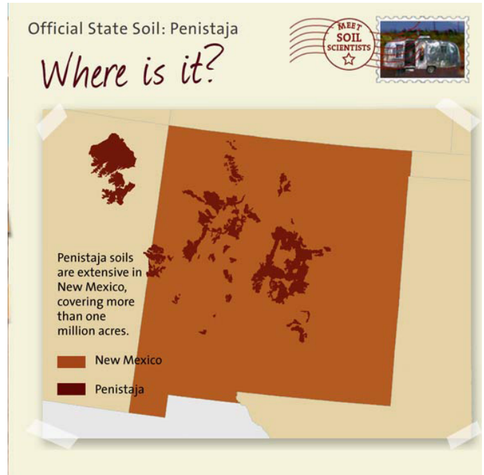
Fig. 3 Location of the Penistaja soil in New Mexico.