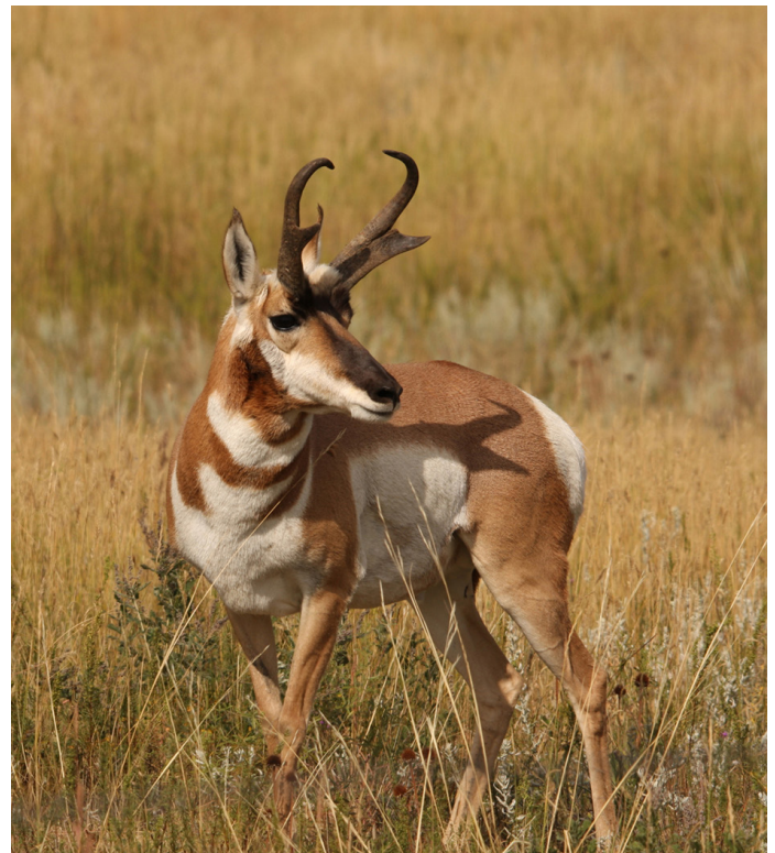
Fig. 4. Pronghorn antelope.

In general, soils can be used for agriculture (growing foods, raising animals, stables); engineering (roads, buildings, tunnels); ecology (wildlife habitat, wetlands), recreation (ball fields, playground, camp areas) and more. Major uses for the Penistaja soil are livestock grazing and wildlife habitat. Almost all ranching operations in New Mexico are family business, and they are the socio-economic baseline for many communities in the state. There are approximately 6,800 beef and sheep producers in New Mexico. In almost 25 percent of New Mexico counties, beef cattle production is the largest economic output of all private industries. In some counties, the beef industry alone provides 40 per-