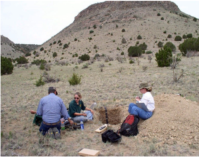
Fig. 2. Soil pit of Penistaja soil – location is close to La Bajada Mesa where the El Camino Real brought many of the early Spanish settlers into Santa Fe. In the early days of settlement (late 1500's through 1600's it would take almost a day to summit this obstacle with wagons!