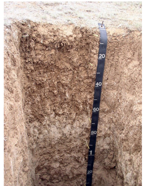
Fig. 1 Soil profile of a Penistaja soil.

The Penistaja soils are found on mesas , plateaus , hills, cuestas , and bajadas . They are formed in alluvium (deposited by water) and eolian (wind-driven) materials derived from sandstone and shales. Penistaja soils are aridisols, or desert soils, that formed in arid or semi-arid climates. These soils typically support grassland sites. Every soil can be separated into three separate size fractions called sand , silt , and clay , which makes up the soil texture . They are present in all soils in different proportions and say a lot about the character of the soil. Penistaja ( Figure 1 ) has a shallow sandy loam topsoil , or A horizon. The subsoil then has an accumulation of clays ( argillic or Bt horizon ) where water from rain has moved the clay particles to this part of the soil. The texture in this horizon is typically a clay loam. Below this horizon, where rainwater does not often seep, is an area with an accumulation of calcium carbonate that will effervesce, or fizz, when acid is added to the soil.