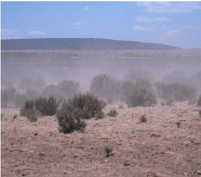
Fig. 5. Wind erosion on rangeland in New Mexico.