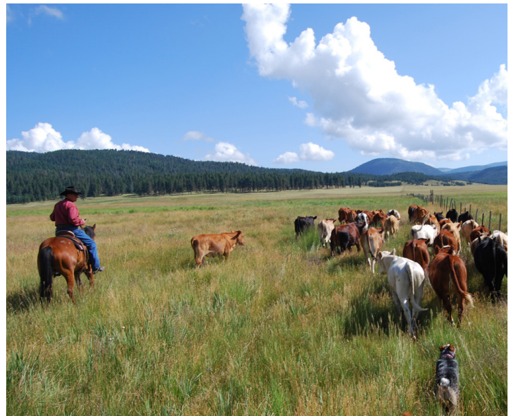
Fig. 6 A range rider moves cattle along a fenceline within the Valles Caldera National Preserve.

cent of the total economic output. Ranching has been a relatively stable economic and cultural foundation for the majority of New Mexico communities.