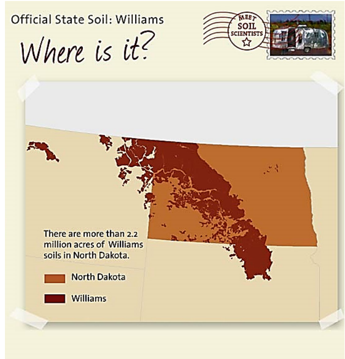
Fig. 3 The range of the Williams soil across North Dakota (credit: Smithsonian Institution's Forces of Change , http://forces.si.edu/soils/interactive/statesoils/html/State-Soils/Default.aspx?selection=NorthDakota&tab=where ).

The Missouri Coteau cuts through North Dakota diagonally, bordered by the James River on the east and the Missouri River to the west. Williams soils are located predominantly in this glaciated Missouri Coteau region ( Fig. 3 ). They occupy higher, rolling convex areas as opposed to depressional swales, or concave areas.