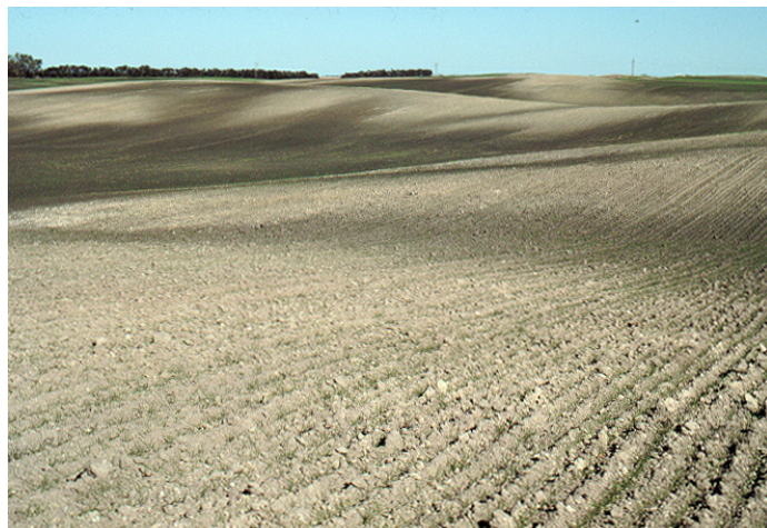
Fig. 5 Typical till plain in production and demonstrates relief as a soil forming factor. Note the differences in A horizon thickness across landscape positions. (credit: USDA-Soil Survey).

Time —All the factors act together over a very long time to produce soils. As a result, soils vary in age. The length of time that soil material has been exposed to the soil-forming processes makes older soils different from younger soils. Generally, older soils have better defined horizons than younger soils. Williams soils formed in a more recent glaciation called the late-Wisconsin, about 10-12 thousand years ago. Comparatively, there are regions of western North Dakota that were glaciated 1-2 million years ago and regions of southwestern North Dakota that have never been glaciated with parent materials that are about 65 million years old. The soils of these regions are older and more highly developed.