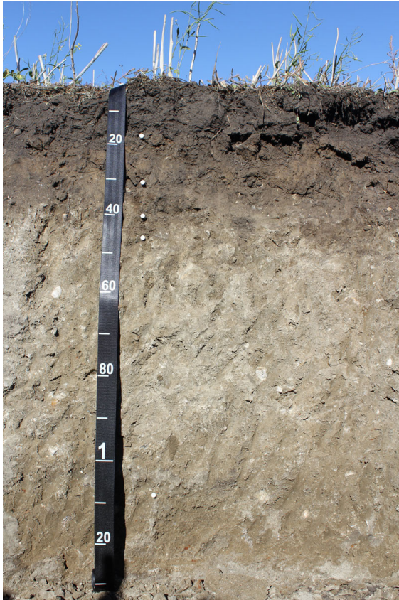
Fig. 2 This shows a profile of a Williams soil, the state soil of North Dakota (USDA-NRCS Soil Survey Staff).

The surface layer, or A horizon, is the darkest layer due to enrichment with organic matter. The texture is typically loam. Beneath the surface layer are the B horizons, layers where changes occur. They are the brown and yellow layers immediately below the surface, and are loam or clay loam. Lowest in the soil profile is the C horizon, the material deposited by the glaciers and from which the Williams soil developed. It is loam or clay loam and likely contains some pebbles or cobbles.