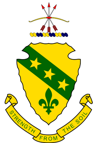
Fig. 1. The North Dakota coat of arms emphasizes the importance of soils.

Every soil can be separated into three separate size fractions called sand, silt, and clay, which makes up the soil texture. They are present in all soils in different proportions and say a lot about the character of the soil.