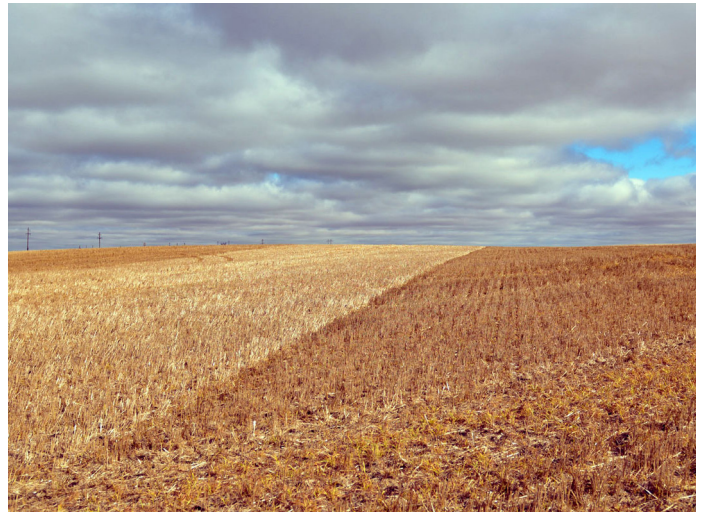
Fig. 4 Harvested wheat on a Williams soil in North Dakota.