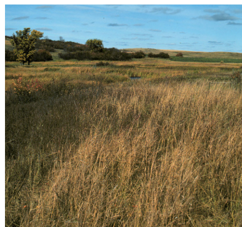
Fig. 6 Typical till plain of the region..

Unglaciated Southwestern (ecoregion 43) – The southwest of North Dakota has been left unglaciated over time. Parent materials in this region are quite old, about 65 million years old. Buttes and badlands can be observed in these regions, and many of the state’s famous fossils have been discovered here.