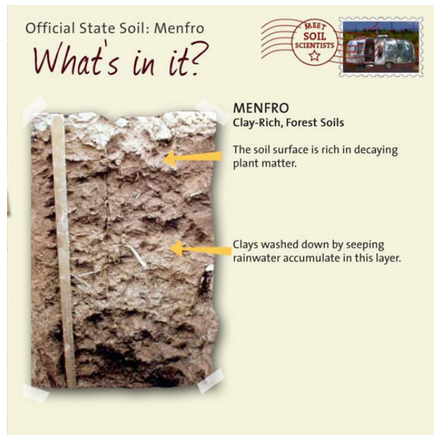
Fig 1. Soil profile of a Menfro soil.

The Menfro series are deep, well drained, moderately permeable soils that were formed in thick loess (wind-blown) deposits on upland ridgetops, backslopes and benches adjacent to the Missouri and Mississippi Rivers and their major tributaries. Every soil can be separated into three size fractions called sand , silt and clay . They are present in all soils in different proportions and say a lot about the character of the soil. The combination of sand, silt and clay particles affect how the soil feels and determines many soil properties. In the Menfro soils, the top layer of soil that we plow and plant seeds in ( topsoil ) is fairly thin, typically around 7.5 cm (3 inches), with 2-4% organic matter . The color is dark brown when moist and the soil texture is usually a silt loam or silty clay loam . The subsoil, below where a farmer plows, is mostly silty clay loam in texture and about 100 cm deep (almost 4 feet). The subsoil has a yellowish-brown color, less organic matter than the topsoil (Figure 1).