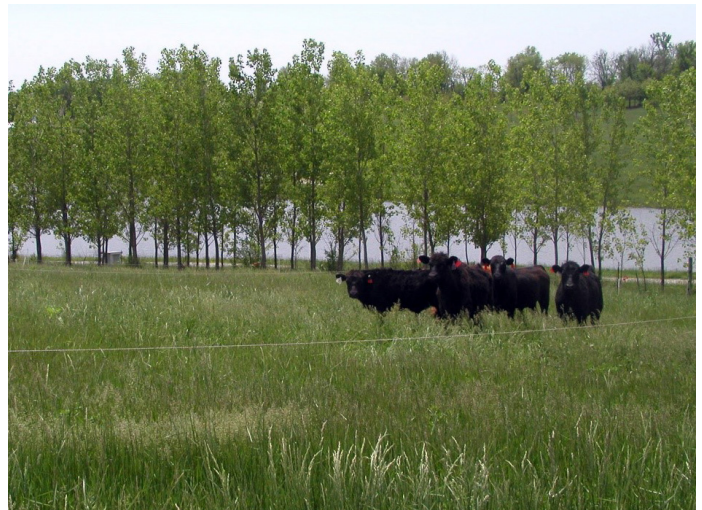
Fig 3. Cattle grazing on a Menfro soil

When a soil cannot be used for one or more of the described functions, it is referred to as a limitation. Soil Scientists , who study the properties of soil and predict soil behavior based on