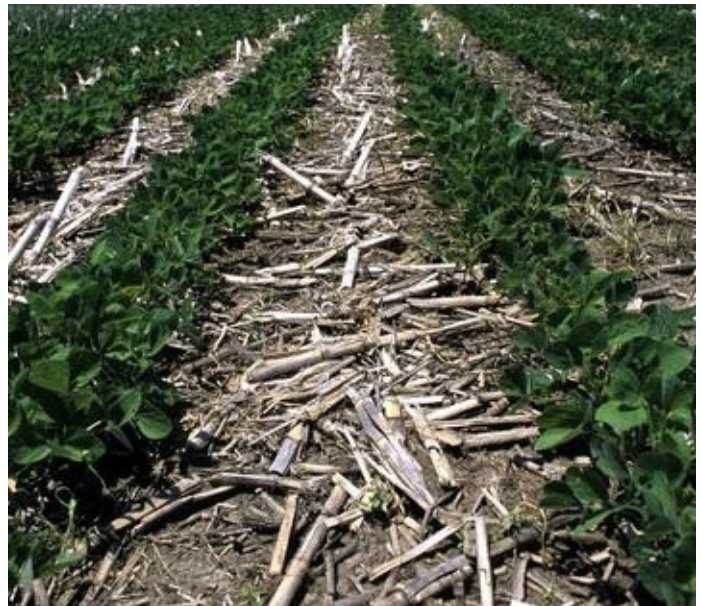
Fig 4. Example of a no-till field.

Since Menfro soils tend to occur on steep slopes, preventing erosion is important! Menfro is a rich soil resource that should be well managed and protected. Without good management practices, soils such as Menfro are highly vulnerable. Many farmers are now converting to “ no-till ” farming ( Figure 4 ). No till farming does not use a plow to turn over the 15-20 cm (6-8 inches) surface of soil ( topsoil ). The result of no-till farming includes better soil structure, increased organic matter, and better water holding capacity. The result of these improvements in soil properties is a reduced chance of erosion.