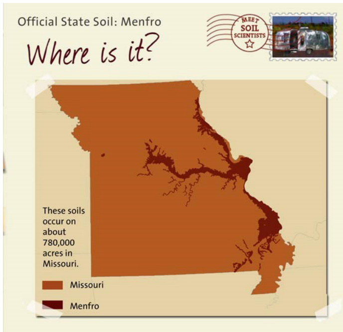
Fig. 2. The Menfro soils are spread along the Missouri and Mississippi Rivers in the State of Missouri and parts of Illinois.