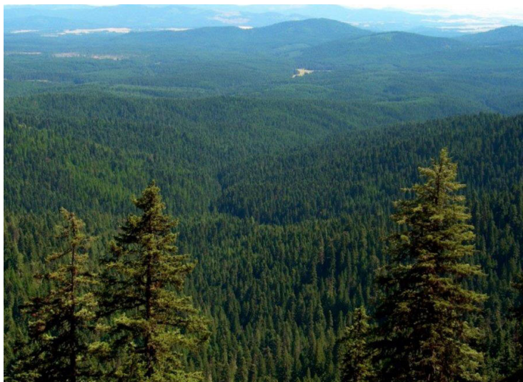
Fig. 2. Typical forested landscape where Threebear soil occurs in northern Idaho.

Threebear soils consist of three distinct layers known as horizons— a forest litter layer, volcanic ash, and loess (carried by the wind) ( Figure 1 ). These soils support coniferous forests ( Figure 2 ). The uppermost layer or soil horizon (O) is made up of needles and twigs that have accumulated at the surface. The next two horizons, a dark-colored A and reddish-brown B have formed in volcanic ash. The volcanic ash was deposited following a huge eruption of Mount Mazama (now Crater Lake, OR) approximately 7,600 years ago. This volcanic ash ranges in thickness from 14 to 23 inches in Threebear soils. The soil horizons (underneath the volcanic ash) have formed in loess, which is dominantly silt-sized material that has been deposited by wind. A light-colored horizon is present just below the volcanic ash and formed as water has removed organic materials, clays, and other pigmenting agents. Over thousands of years, the sub-surface silty clay loam horizons have become very dense and are referred to as a fragipan. The fragipan occurs at a depth of 23 to 40 inches, and because of its high density, is not permeable to water and plant roots.