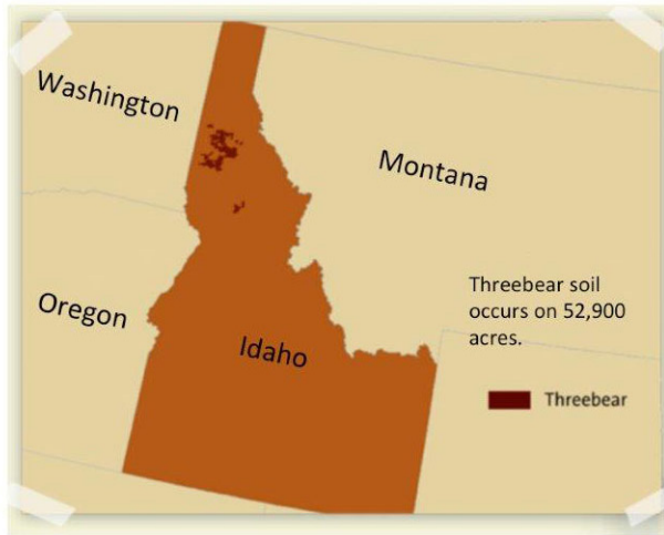
Fig. 3. Location of Threebear soil in northern Idaho.