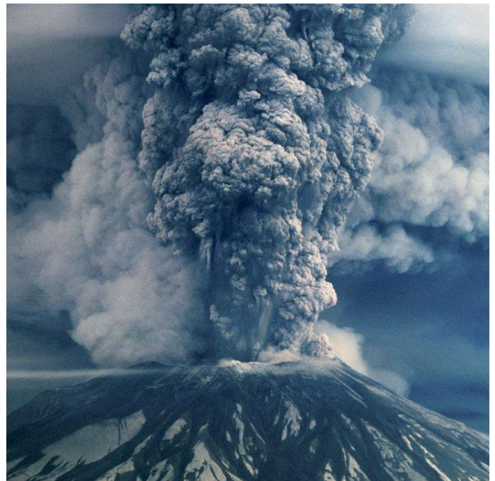
Fig. 5. Volcanic eruptions like this 1980 eruption of Mt. St. Helens in Washington state have periodically deposited ash across the Pacific Northwest Region. Volcanic ash found in Threebear soil came from a much larger eruption in Oregon 7,600 years ago.

Like all soils, Threebear soil is a valuable resource and must be cared for to maintain its productivity. The volcanic ash found in surface horizons is very susceptible to erosion. The forest litter layer protects the volcanic ash. But if the litter layer is removed either by fire, by timber harvesting activities, or other disturbance, rain and snowmelt can erode away the volcanic ash. Because the volcanic ash is an important contributor to the water holding capacity of Threebear soil, its loss will result in decreased forest productivity.