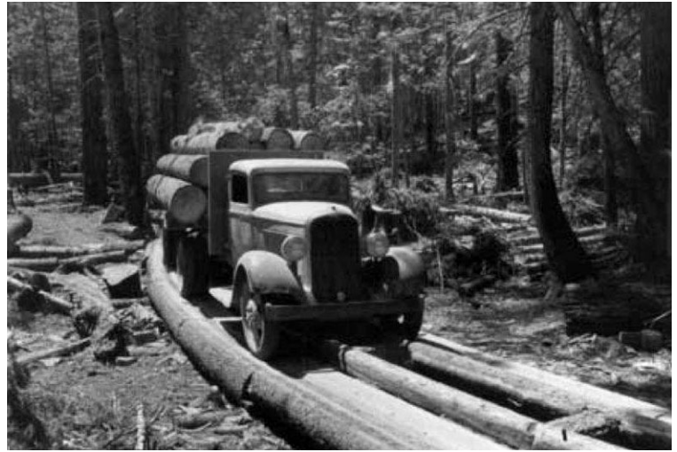
Fig. 4. Some of the best timber in northern Idaho is produced on Threebear Soil. This USDA-Forest Service photo from 1935 shows a loaded logging truck in the Clearwater National Forest where Threebear soil occurs.